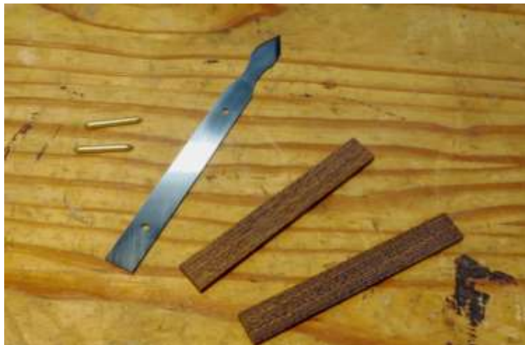
Knife kit with blank, brass pins and user supplied wood scales

These Narex Dual Bevel Spear Point marking knives are made by Narex a world-class Czech edge tool maker. These blades can be used either unhandled or wood scales can be added to create a comfortable, easy-to-grip handle. These knife kits contain a blade blank and 2 brass pins needed to affix scales to the blade. All you need to add are the wood scales. Adding wood scales is very easy and a great way to use some of those small hardwood or exotic wood scraps you have lying around.